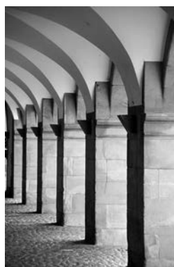
Under the Lucerne Town Hall at the Town Hall basement