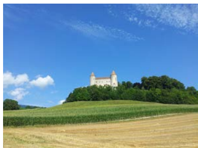
Château de Champvent