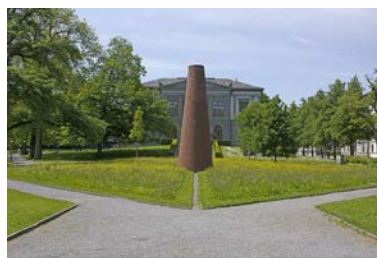
East side of the Natural History Museum in St. Gallen, Author: Memoria St. Gallen