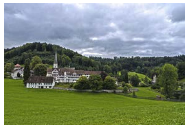
Magdenau abbey as HDR image