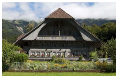
The farmhouse of Ostermundigen (1797) in the open-air museum Ballenberg, Author: Chme82