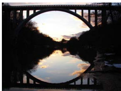
Halenbridge in Bern, after sunset, perfect arc mirroring