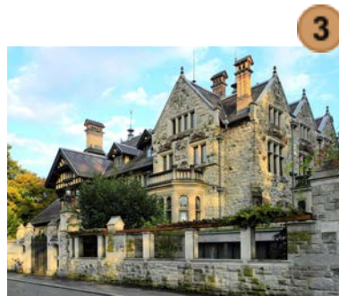
Villa Egli in Zurich Author: roland zh