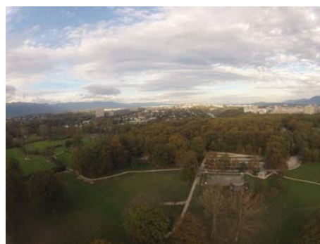
Canton of Geneva