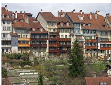
Old City of Bern, Author: Geri340