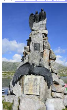
Monumento Guex in Airolo, Author: Cassinam